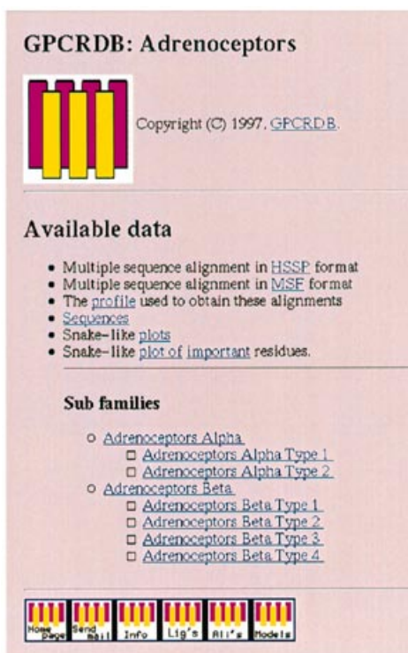
Figure 4. Example of one of the 151 subfamilies specific pages. All underlined words and icons are hyperlinked for navigation through the GPCRDB.

where appropriate. Figure 4 shows the WWW page for the adrenergic receptor class as an example of the data organization.